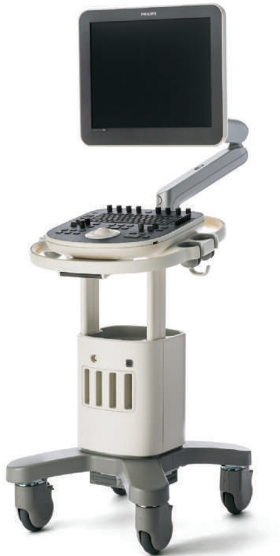
ClearVue 550 features a 19-inch, fold-down LCD monitor with full motion, articulating arm, and on-cart storage.

ClearVue 550's elegant design hints at the reduced complexity of the system. The modular design means enhanced serviceability and reliability inside a lightweight cart for increased mobility and maneuverability.